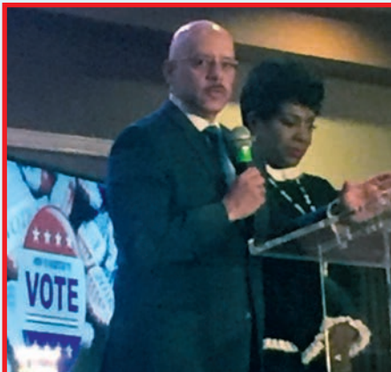
Sen. Hughes and his wife Sheryl Lee Ralph speak at a "Souls to the Polls" event.

My wife Sheryl Lee Ralph and I believe that voting is empowerment. It allows us to have a direct voice in our democracy. It's a right that our ancestors fought for, so we must not take that right for granted. Getting in the voting booth and selecting our elected officials is a direct way to fight for our rights.