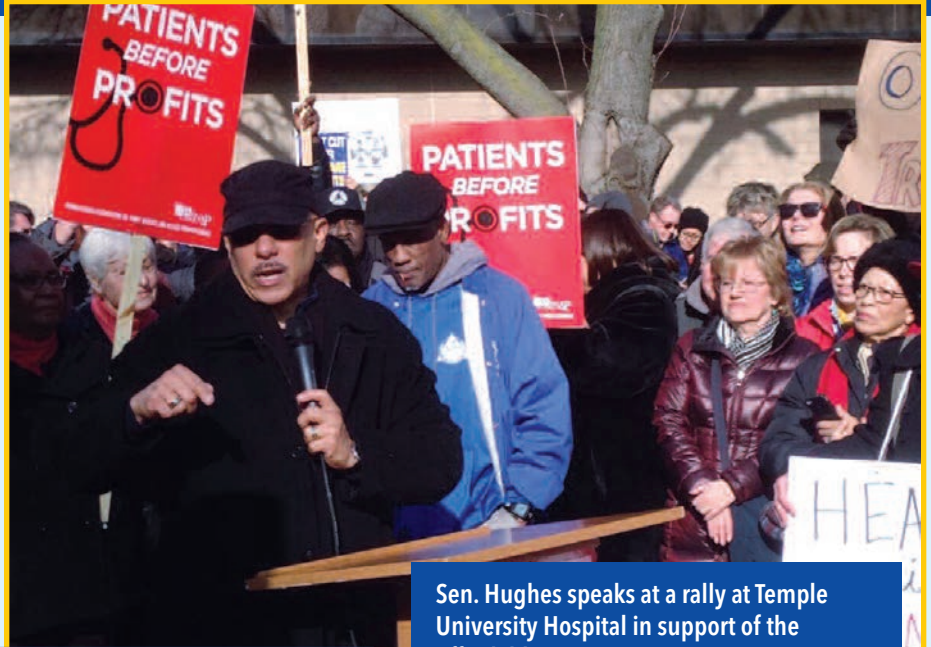
Sen. Hughes speaks at a rally at Temple University Hospital in support of the Affordable Care Act.