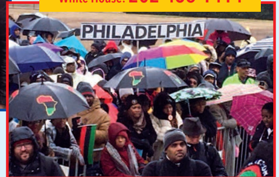
Philadelphians join in at the Martin Luther King, Jr. Day March in Washington, D.C.