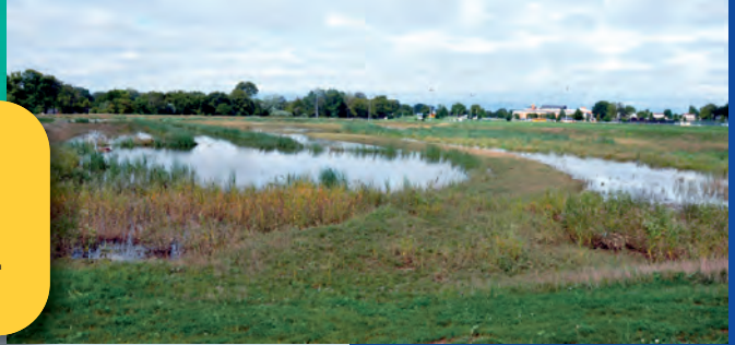
Above is the McCarthy Park water basin which is used to drain area roads during heavy rains.

There still remains much more work that needs to be done to alleviate the flood problems that occur in Whitemarsh Township. It will take a partnership at all levels of government, along with an engaged constituency, to solve all of the issues. It will also take everyone working together to make sure that important programs like Pennsylvania's H2O program, and many other programs — both state and federal — are appropriately funded, so that the dollars are in place to help out local communities who can't fund these solutions on their own. The McCarthy Park detention basin initiative, is a great example of how these programs can make a difference, and why they should be supported.