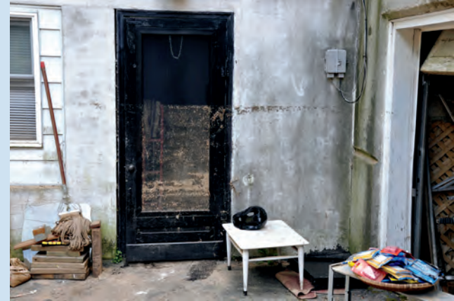
Senator Hughes has toured areas of Whitemarsh Township that have been impacted by flooding.