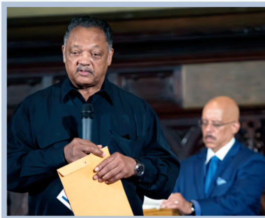
Civil rights icon Rev. Jesse Jackson addressed the forum.